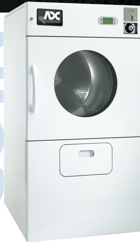
ES-50 Coin Dryer