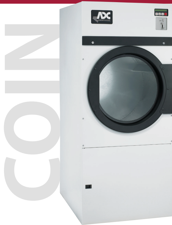
AD-24 Coin Dryer