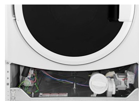
FRONT ACCESS PANEL