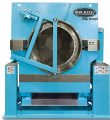
Braun 250 N2

Braun Washer/Extractors are designed in such a way that the load balances itself prior to moving into the extraction phase. By slowly ramping up to a programmable extraction speed, Braun Washer/Extractors evenly distribute the wet goods against the cylinder, eliminating the need for artificial counterbalances. This balance method results in consistent thickness of goods throughout the cylinder, delivering a uniformly extracted load, free of wet clusters which greatly hinder the efficiency of your drying and finishing areas.