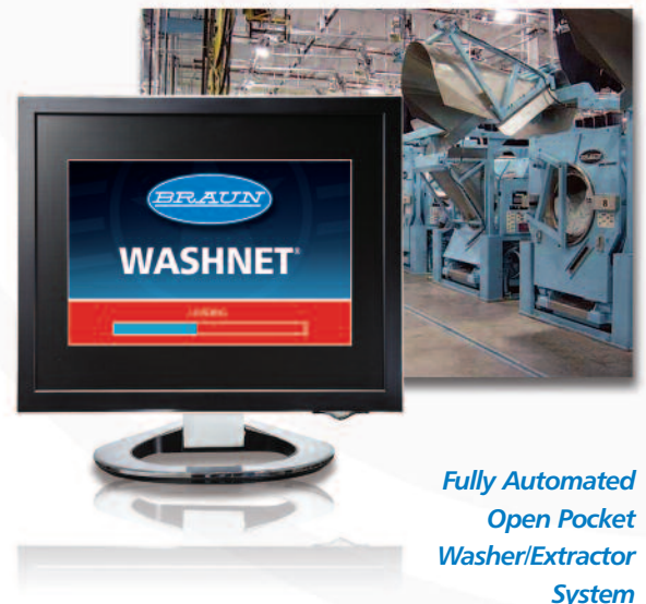
Fully Automated Open Pocket Washer/Extractor System

Whichever model meets your needs, Braun's design engineers will smoothly integrate the new machines into your plant layout to reduce the number of full time employees while optimizing material flow. Braun's team will use